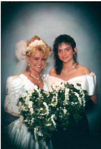
The bride with her Maid Of Honor is a very big seller. Their arms should be around each other's waists. Pose them with their outside shoulders angled in towards the camera. This also helps them to appear slimmer.