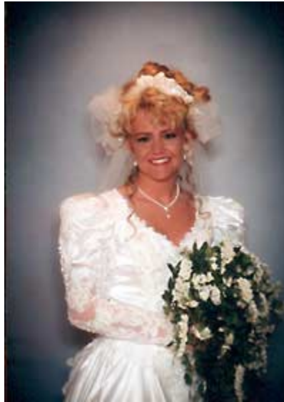
This is a shot of the bride before the ceremony in front of a painted background. The flash is on a stroboframe bracket to knock those background shadows down.