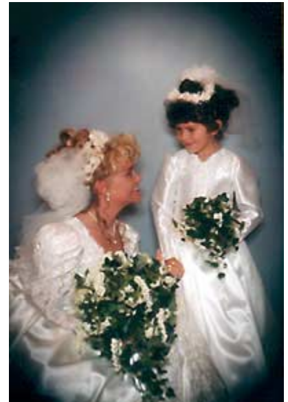
For added closeness, a nice change is to have them looking at each other. You can be assured the bride and the flower girls parents will want to purchase one or both of these two poses!