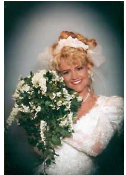
This is a variation of the last pose... a little closer in with the bouquet held a higher with the bride's head tilted toward the bouquet.