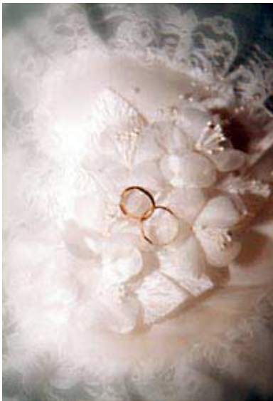
This is a shot of the rings taken before the ceremony on the ring bearer's pillow. The flash is removed from the bracket to give a dramatic sidelight. You can also use a star filter to enhance this shot.