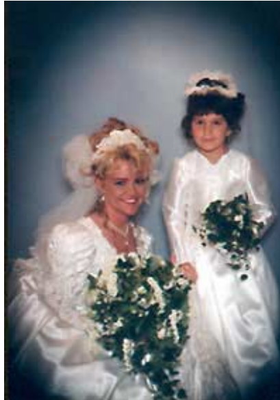
This is the bride kneeling with one of her flower girls.